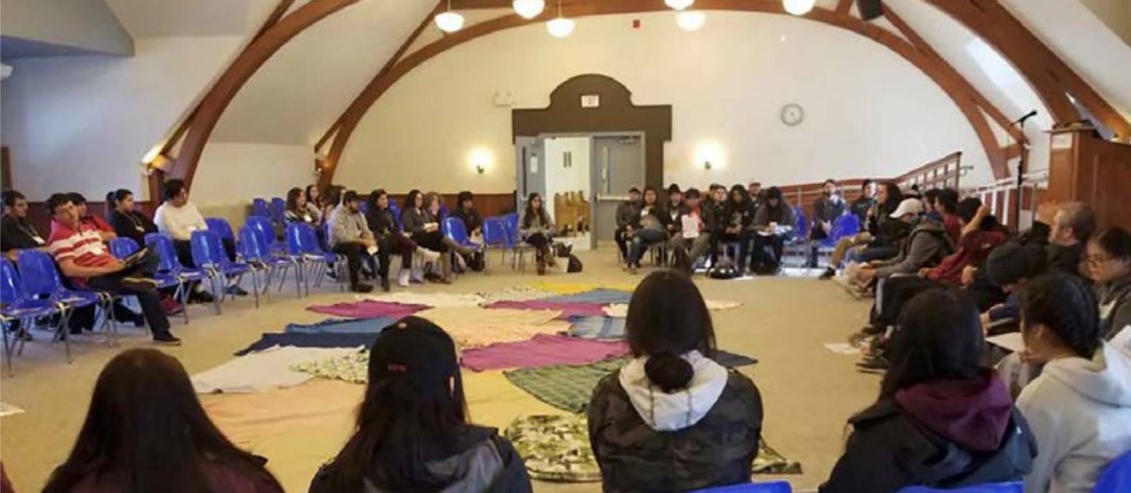
Students from Dennis Franklin Cromarty High School, St. Ignatius, and Superior C.V.I. participate in the KAIROS Blanket Exercise as part of the 3 rd annual Indigenous High School Law Day.