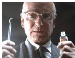
Laurence Olivier photo still Marathon Man

As we are about to begin another academic year we might do well to remember some sage advice from Dr. Szell (Laurence Olivier) in the movie Marathon Man . As he is preparing to torture PhD student Babe (Dustin Hoffman) with a dentist drill, he says: "I envy you your school days. Enjoy them fully."